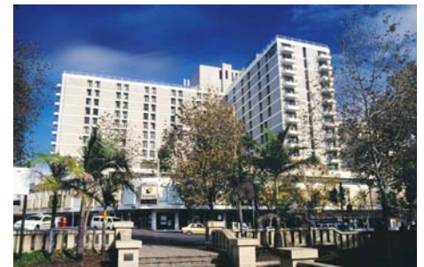
Formerly - Oxford Koala Motor Inn

Monument is now a high-quality, 16-level apartment building including 86 one-bedroom, 69 two-bedroom and 36 three-bedroom apartments with a mix of single and double storey layouts.